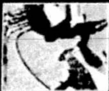
Quick Hitch® quick attach system.

Mounts to all Alamo Industrial Boom Mowers including the A-Boom, Versa™ Boom, Machete™, Rear Mount Boom and the Maverick™, which are available in ranges from 17' up to 36'. When used in conjunction with the Quick Hitch® quick attach system, the BuzzBar can be taken off and switched with another head in minutes! (Some models of the BuzzBar are not available for use with certain boom lengths - inquire with customer service for specific combinations.)