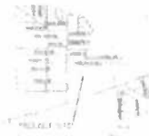
LOCATION MAP - N15 SEC. 36 T66S R27E